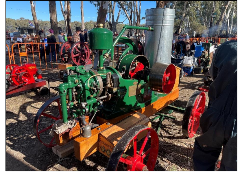
Wentworth Junction Rally